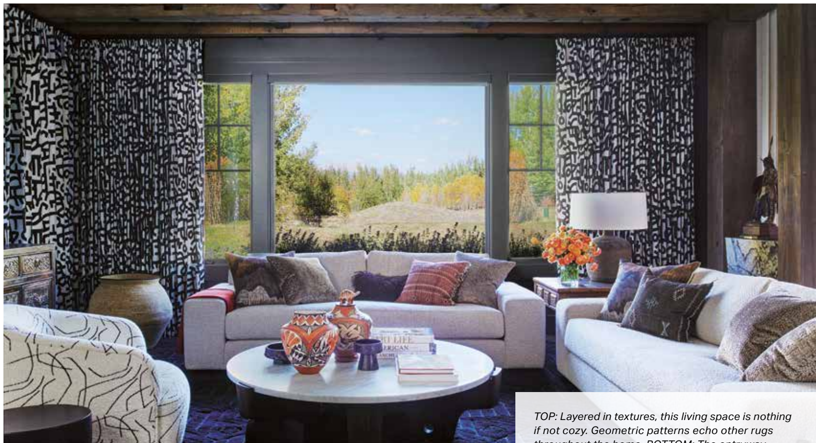
TOP: Layered in textures, this living space is nothing if not cozy. Geometric patterns echo other rugs throughout the home. BOTTOM: The entryway chandelier of steel and rock quartz crystal is a modern take on the classic Western wagon wheel. >>