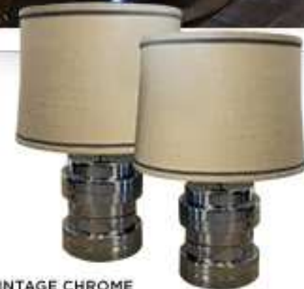
VINTAGE CHROME STACKED TABLE LAMPS