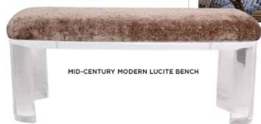
MID-CENTURY MODERN LUCITE BENCH