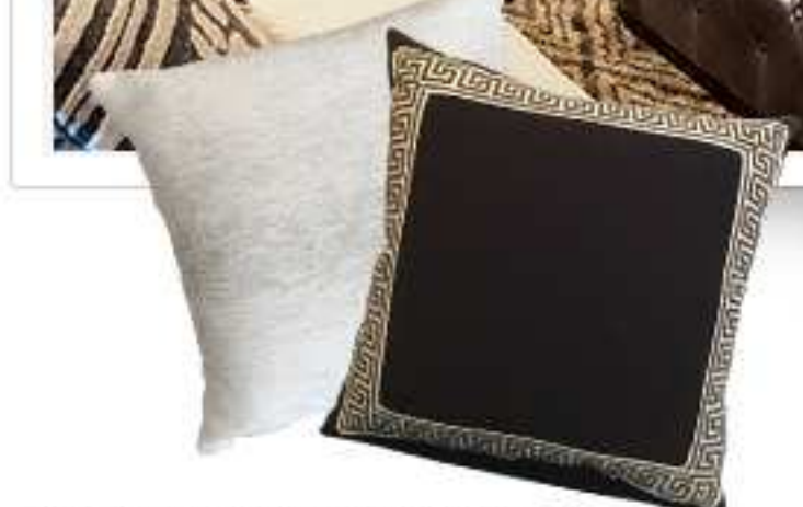
JUDE CASSIDY WHITE AND GOLD PILLOWS, LACEFIELD CHOCOLATE VELVET PILLOWS

“ Travel, first and foremost is my go-to source for inspiration. ”