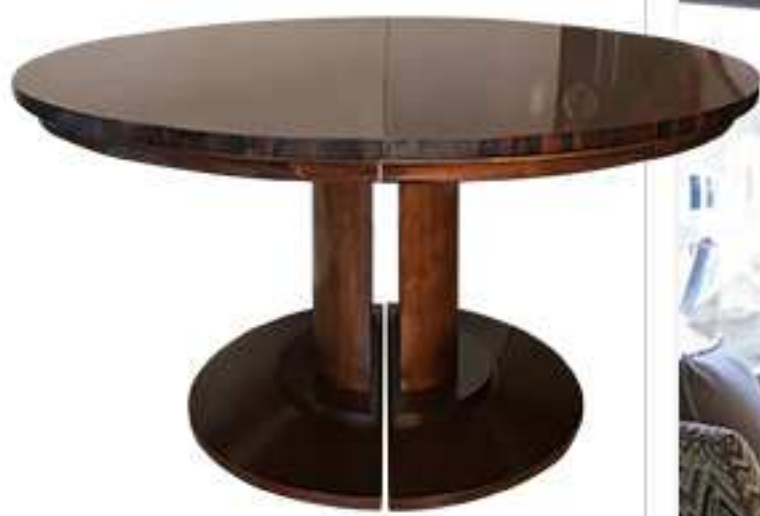
CENTURY FURNITURE CUSTOM HAIKOU ROUND DINING TABLE

“ Traveling the world as a child left me with a vast and vivid memory of the world's most beautiful places, and has been my inspiration as a designer. ”