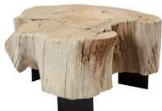
MIMI LONDON CYPRESS TABLE WITH MORRO FEET

“ Traveling the world as a child left me with a vast and vivid memory of the world's most beautiful places, and has been my inspiration as a designer. ”