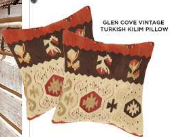
GLEN COVE VINTAGE TURKISH KILIM PILLOW