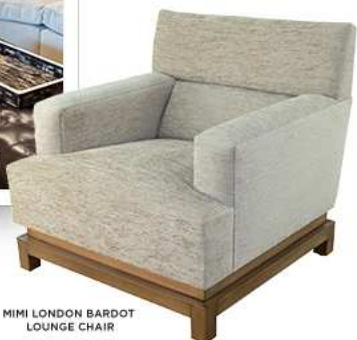
MIMI LONDON BARDOT LOUNGE CHAIR