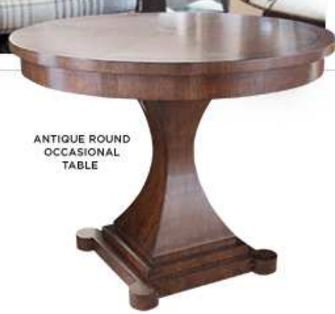
ANTIQUE ROUND OCCASIONAL TABLE