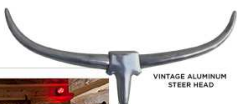
VINTAGE ALUMINUM STEER HEAD