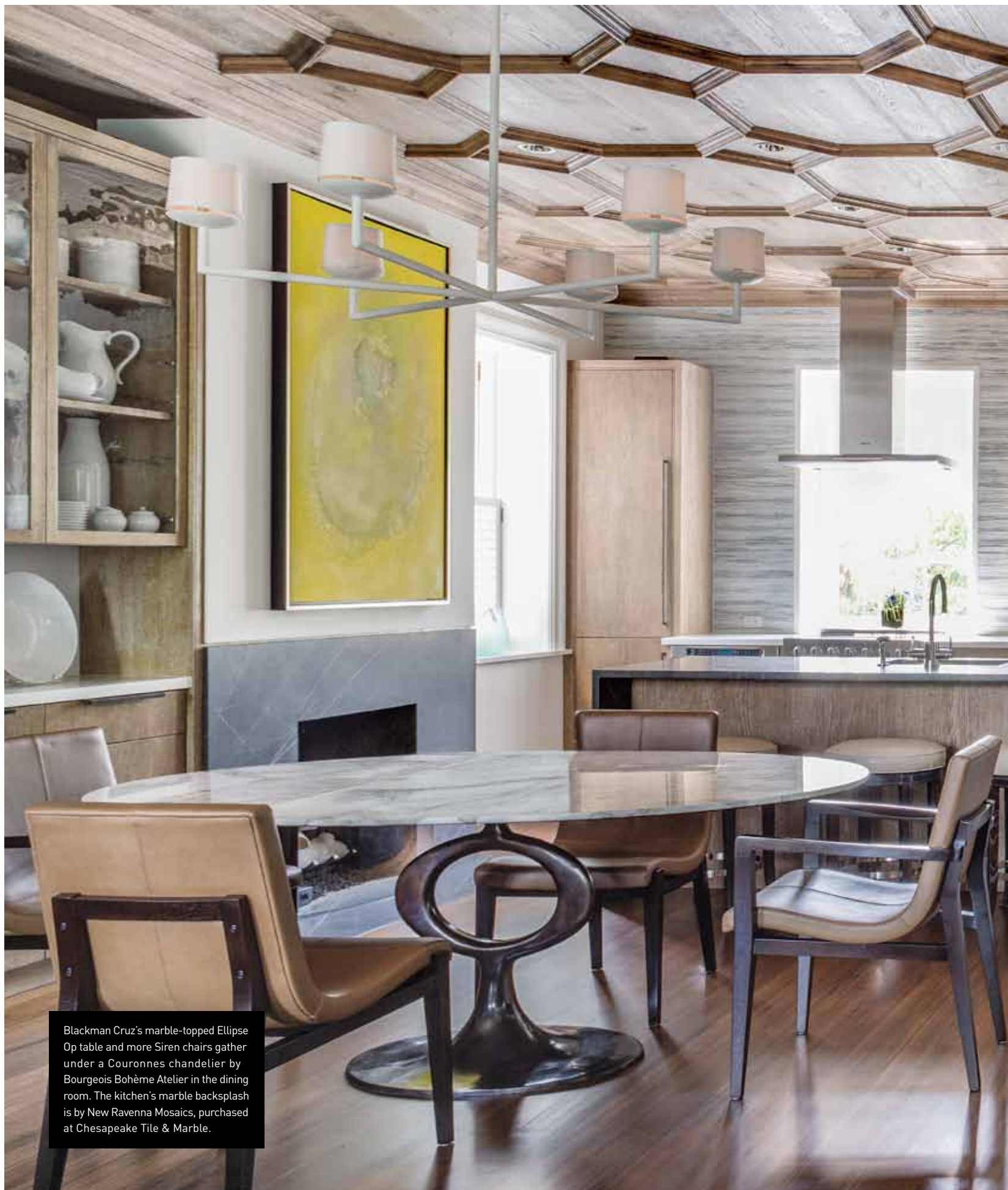
Blackman Cruz's marble-topped Ellipse Op table and more Siren chairs gather under a Couronnes chandelier by Bourgeois Bohème Atelier in the dining room. The kitchen's marble backsplash is by New Ravenna Mosaics, purchased at Chesapeake Tile & Marble.