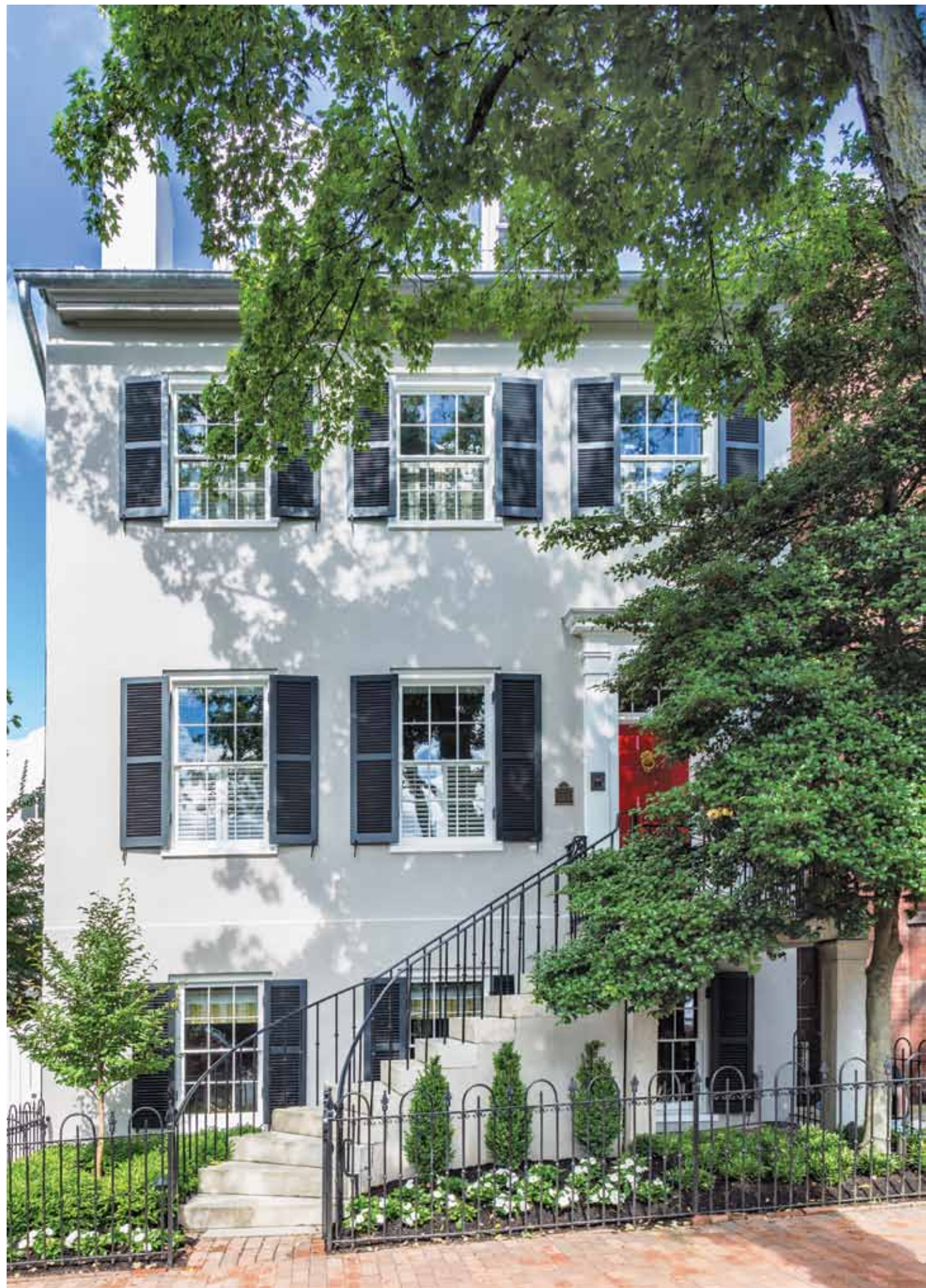
Barnes Vanze Architects meticulously restored the windows and façade to their original Georgetown elegance, capturing the bowing bricks by building an interior-reinforced concrete shell.