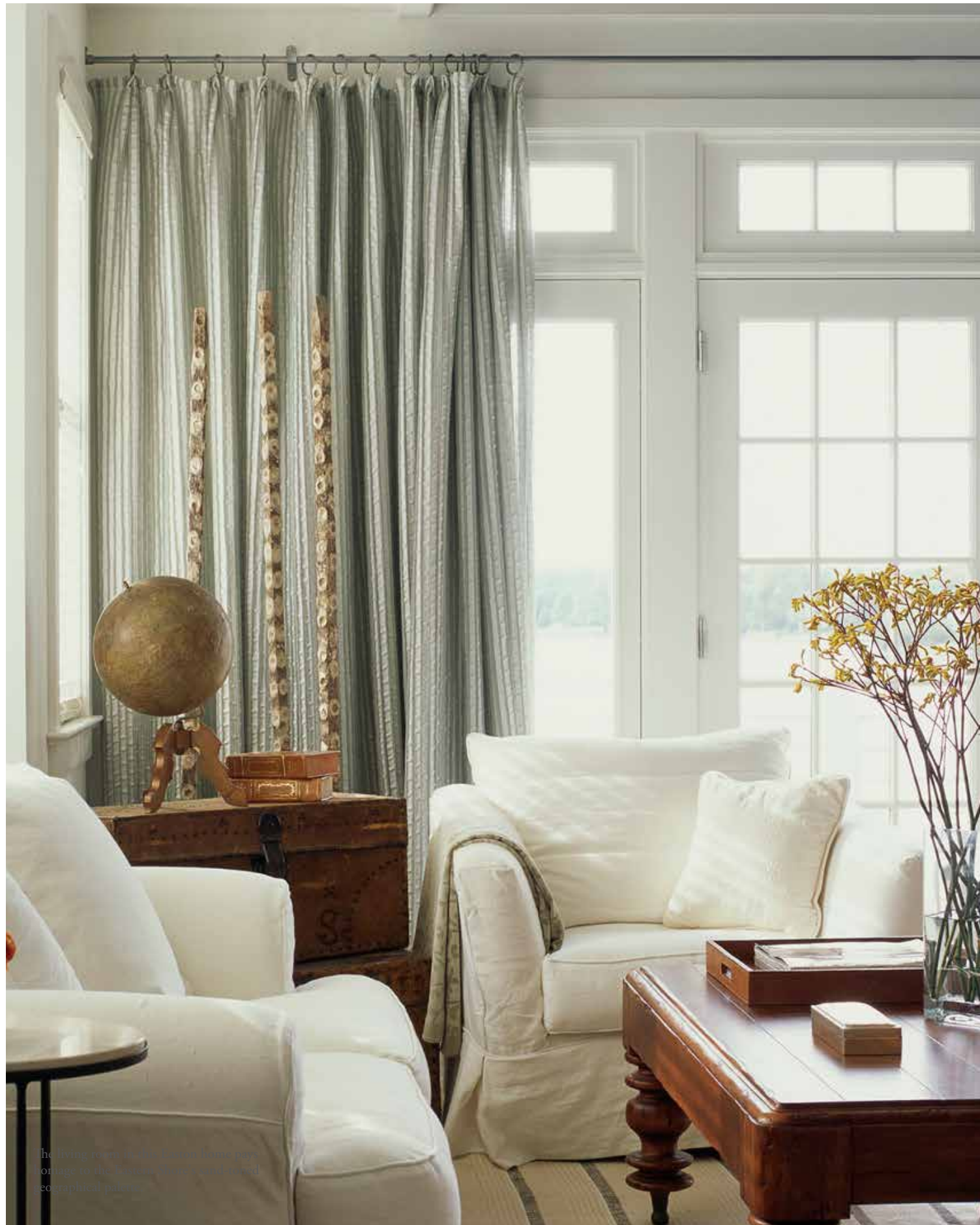
Opposite: The living room in this Easton home pays homage to the Eastern Shore's sand-toned geographical palette.