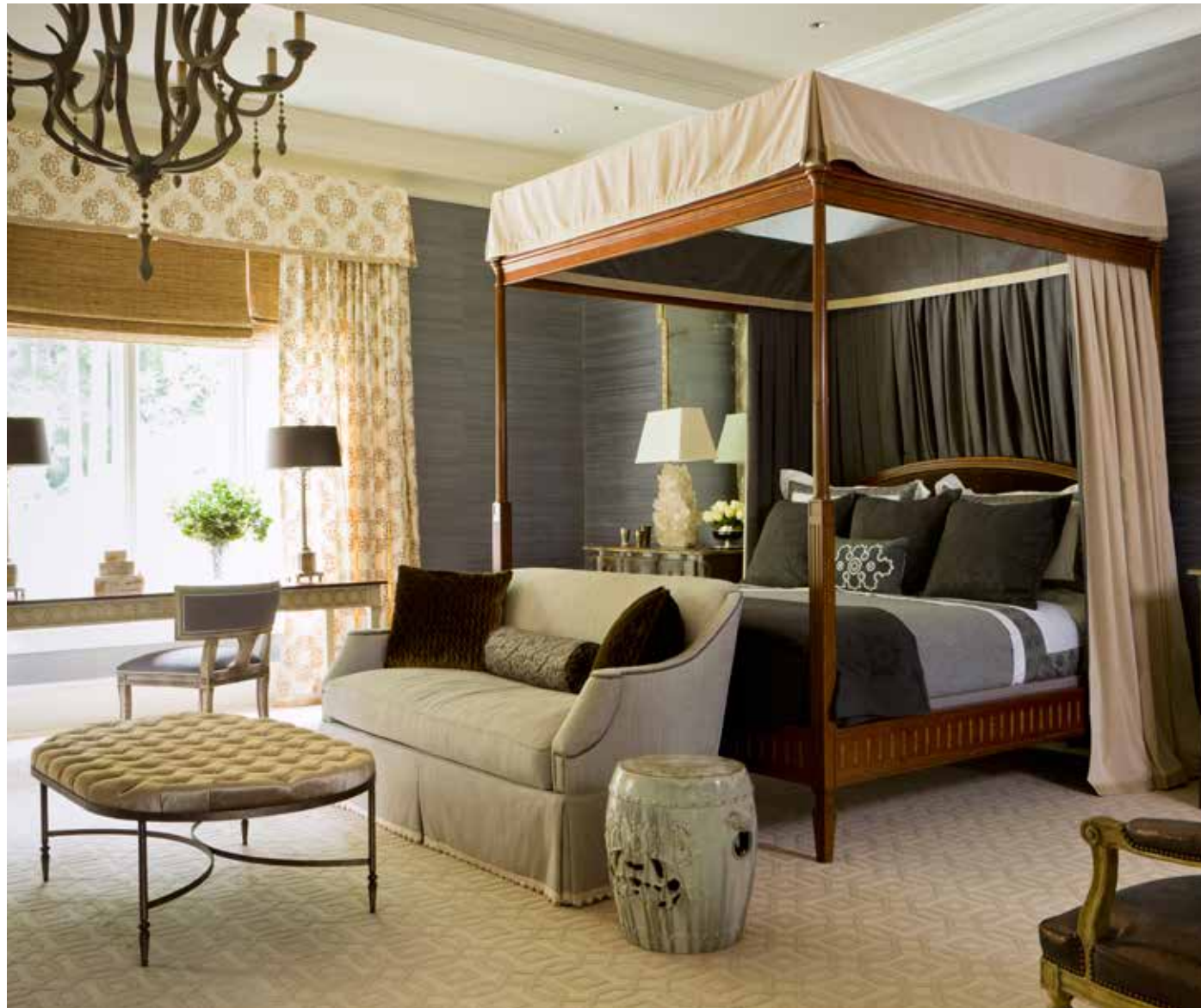
In this Greenspring Valley bedroom, a disciplined earth-toned palette frees the imagination to roam beyond walls. Opposite: Whites vary in shade, subtly defining the living room in this Greenspring Valley home.

In creating Pazo, Foreman and Sutton traveled throughout Spain and Italy exploring the food, architecture, and landscape. Pazo's Mediterranean character is captured in the large pottery vessels that preside in the bar area, as well as in the earth-toned walls and furnishing that contrast with rich red shades suspended over the bar. As evident in Pazo, Sutton's interiors have a decidedly masculine component. Sutton uses a lot of earth tones, shades of beige and browns, and objects such as large muscular vessels, and very little, if any, frill and lace.